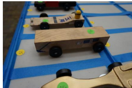
Ian's 5-minute creation, the "block of wood" and it was a winner!