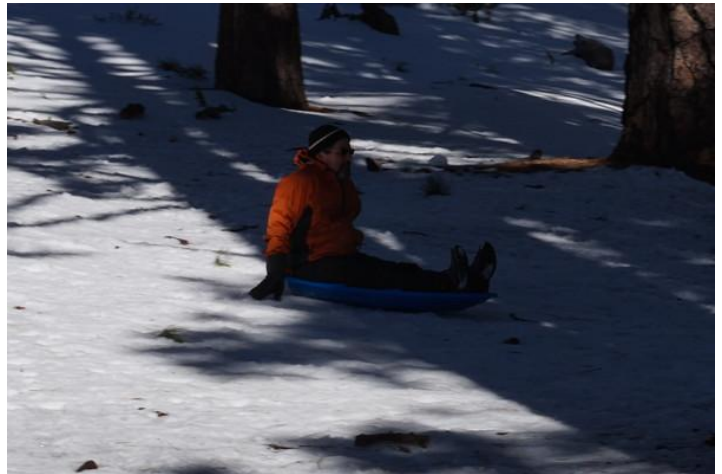
This is even more exciting than it looks – have to avoid trees, tree stumps and wooden posts.