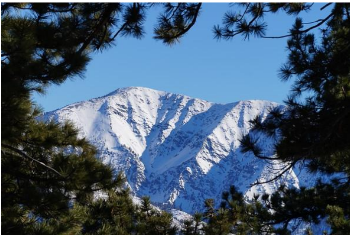
North side of Mount Baldy