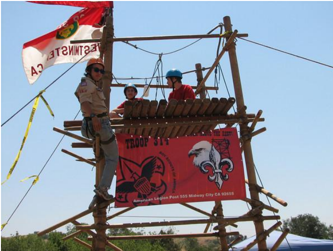
Tower in operation, doing its job of impressing Webelos. – Does look good.