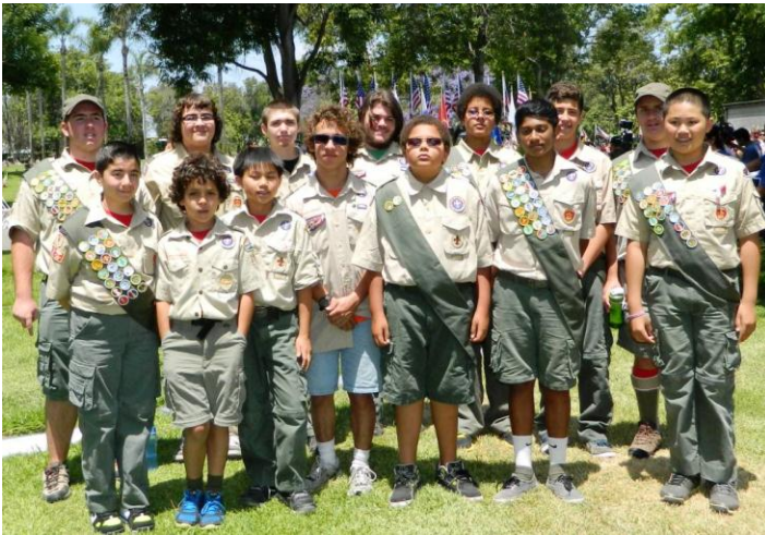
Good looking Scouts