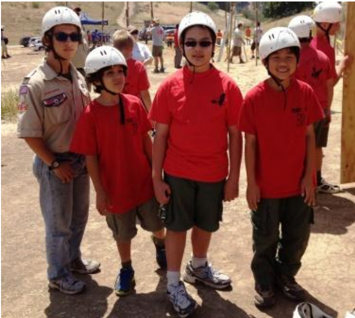
Wanted in 23 counties.