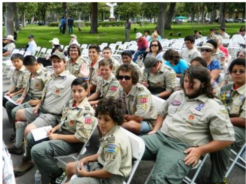
Troop turns out.