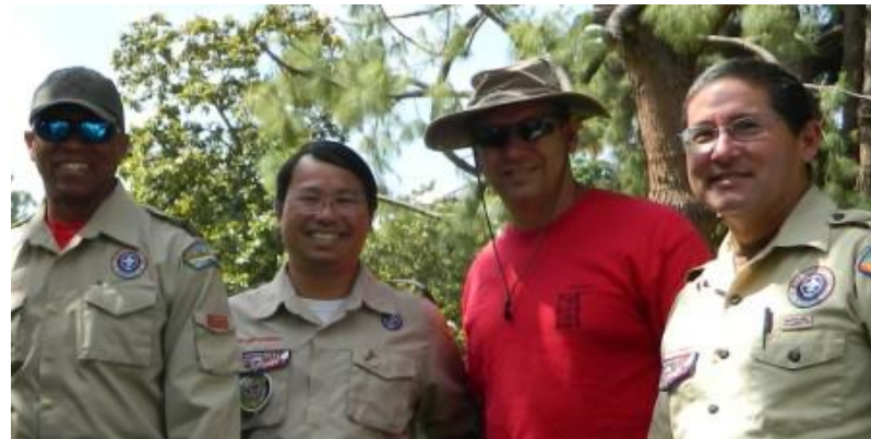
And some of the awesome Rocking Chair patrol