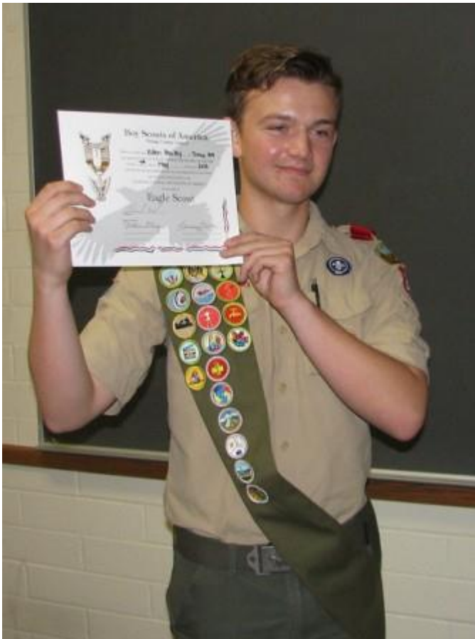
Proud Troop 314 Eagle