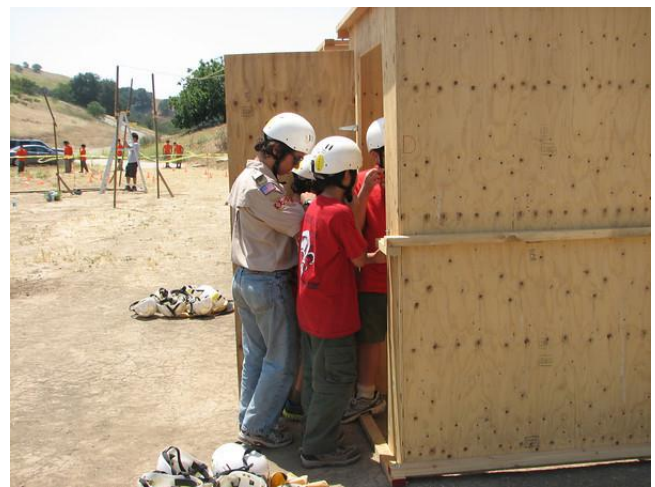
Phoenix Patrol enter cellar.

http://richmaru.smugmug.com/Kids/Scouting/Camporee-2013/29910956_wzGhdc#!i=2566674706&k=z9hxNQG