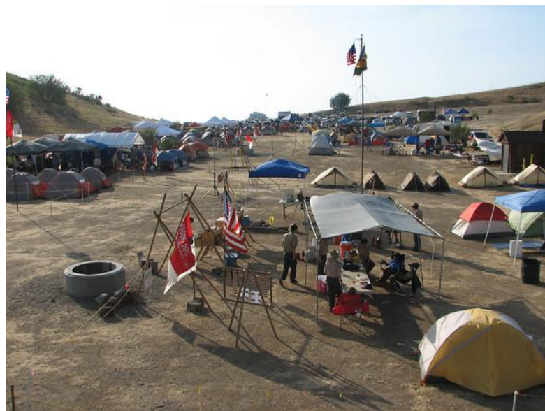
Camporee as Viewed from our Tower!

The runner-ups were the older Scout Bull Shark Patrol.