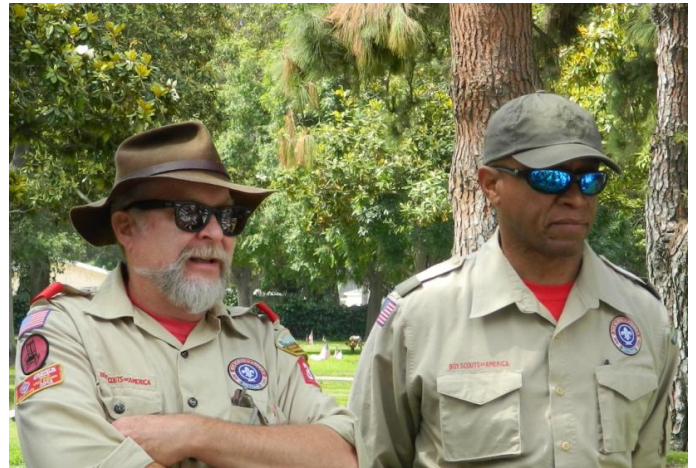
Looking for a rocking chair