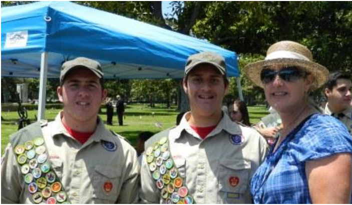
Scouts and Mom