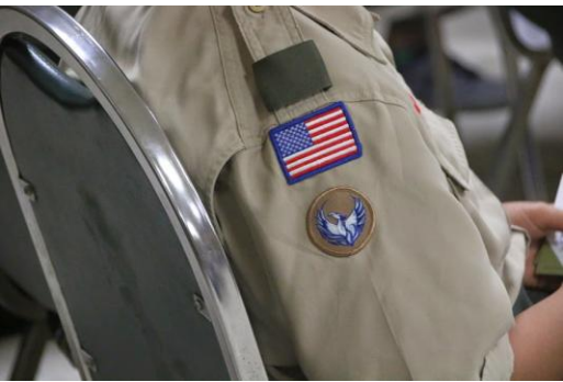
The proud insignia of the Blue Phoenix.