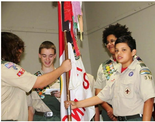
APLs are sworn in.