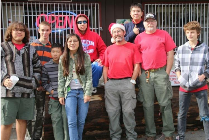
The Christmas Cheer Team.