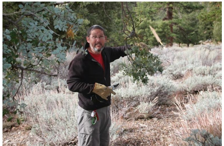
You get the good stuff off the tree