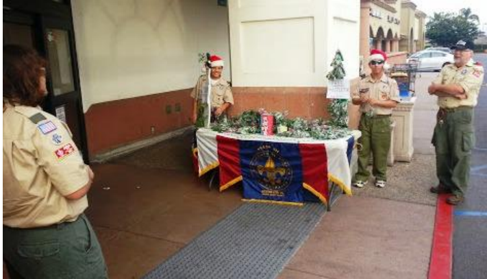
Passing out free Mistletoe