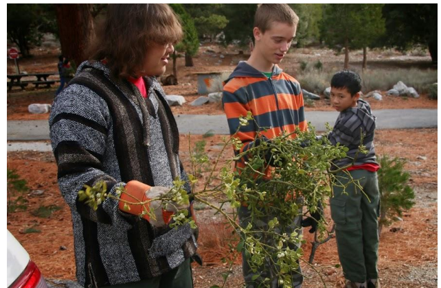
Hey the stuff is just lying on the ground!