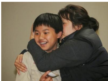
Rank comes with risk of Mom attack.