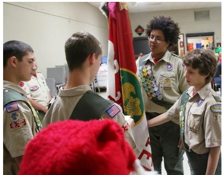
New Troop 314 leaders are sworn in.